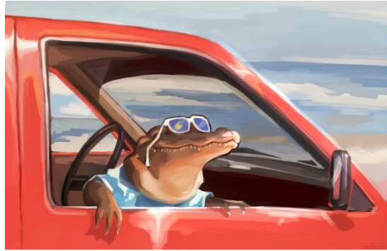
Coco Summer by Zechomo (Spain)