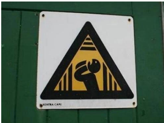
You can't throw tantrums here

It was a little tricky, but it and others were worth the $5 collected.