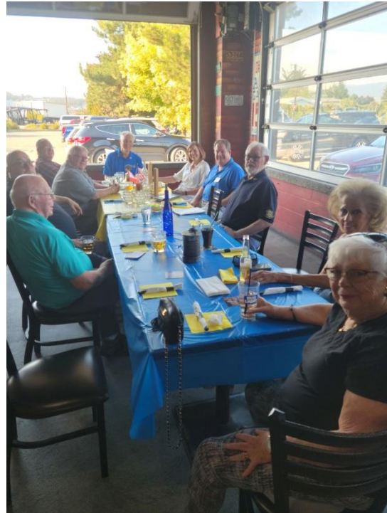
Club members in mid-joie de vie

and after an evening of joie de vivre she presented her thoughts on how she would like to see her year unfold.