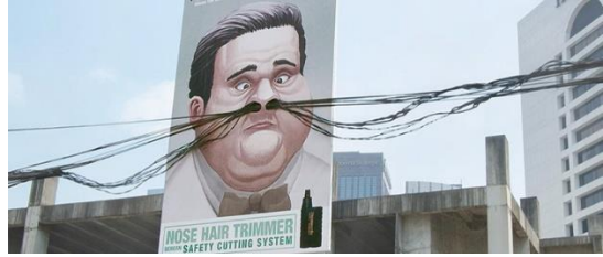
Nose hair trim billboard