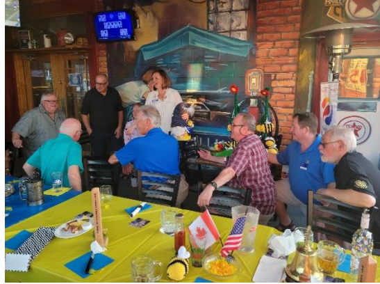
Club members kneel in fealty to the District Governor

Annual Dues – The Board of Directors voted to set this year’s dues at $260. They are due now and the Treasurer has requested they be paid in cash or cheque to avoid bank charges.