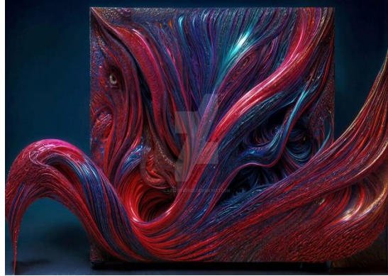
Crimson Consciousness by Artfireforge (USA)