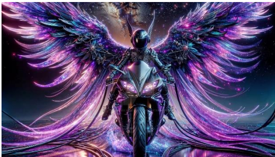
Mystical Purple Angel Biker Girl by Adayasilverclaw507 (USA)