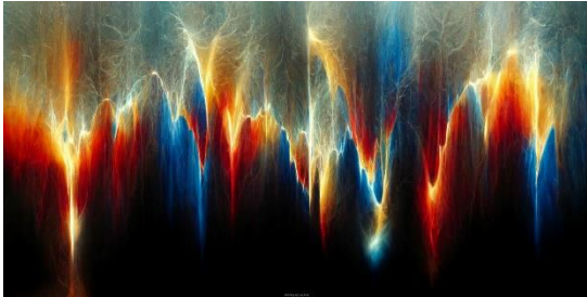
Melodies of the Valar by Mihaylov AI Art (Bulgaria)