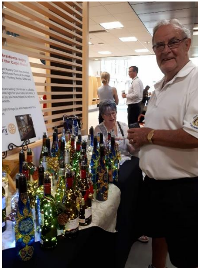
Excellent selection of lighted bottles

Each "Christmas in a Bottle" sells for $20 and includes: a string of lights and switch in a wine bottle, an AA battery, a Christmas decoration that can be taken off when it's not Christmas, a wine gift bag, and a pamphlet explaining the Rotary Club of Kelowna Capri sponsorship of the annual Cottonwoods Christmas Party. We are also selling the lights separately for $10 each.