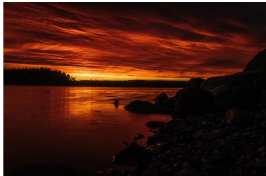
Burning Sky II by Markus (Finland)