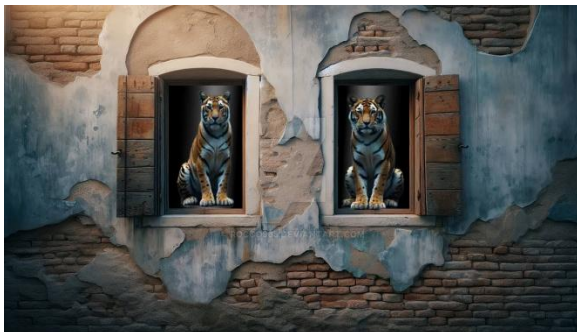
Nosy Neighbors by Rocco965 (Serbia)