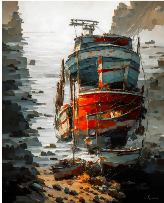
Well Grounded – Too Well in Fact by Lewis Skevington (UK)