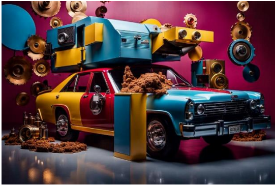
Goes Anywhere 1 by Fleetofgypsies (Austria) - sculpted combine assemblage art