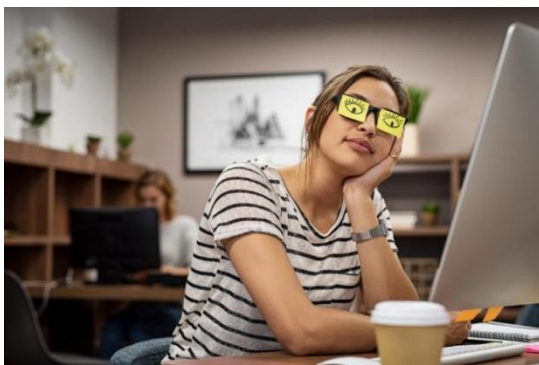
Zoom meeting glasses