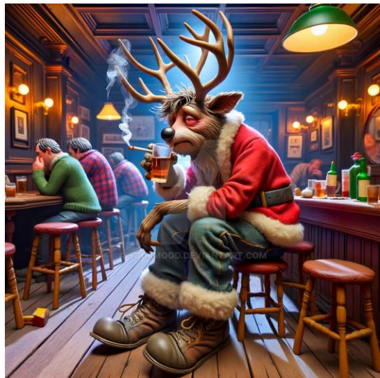
Blitzed Zen by Sourmood (USA)