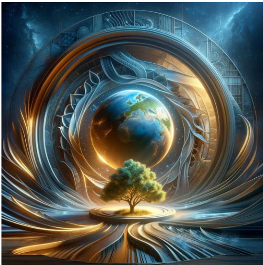
Unity Embraced by Coexilia - Aurora Solstice (USA)