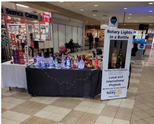
Lights in a Bottle sales table at the Capri Mall

“Sally Ann” Kettle season is under way for us. Each Monday we have been slaving away on a kettle at Walmart. Our last day will be December 18 th so feel free to drop by with your donation.