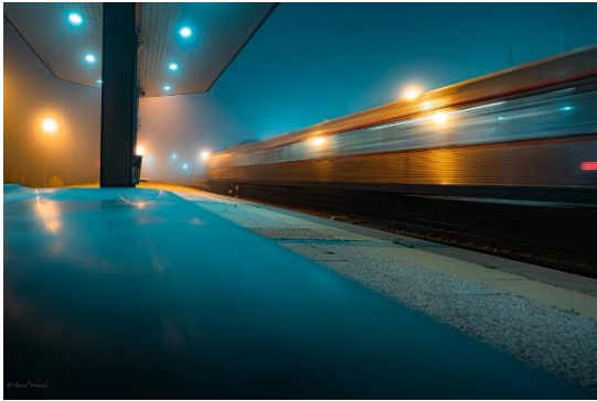
Night Train by Isischneider (Portugal)