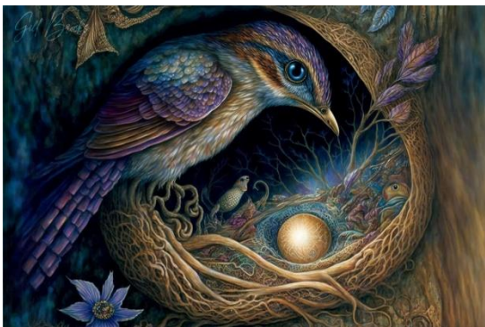
The Golden Egg by Gillyb (UK)