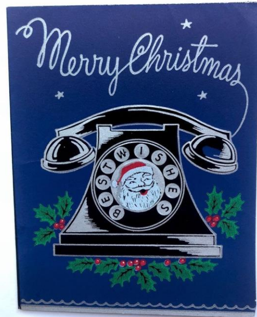
A rotary Christmas card

Thursday, December 16, 2021 at 7 pm. Meeting will be in person at Yanni's Grill and by Zoom.