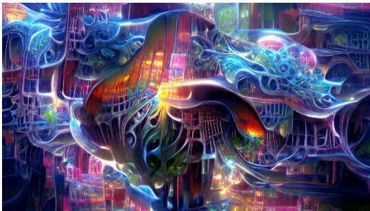
Arcology