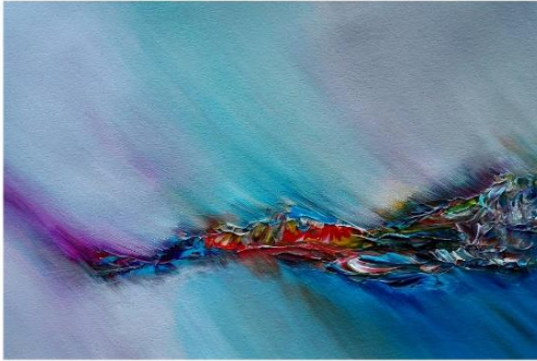
Dreamsserie 1 by Martina Dibella (Italy) - martinadibella.altervista.org