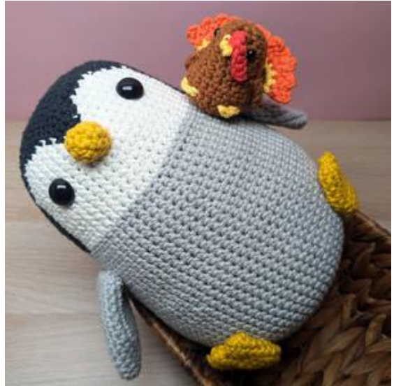
The Egg Hatched – What a Big Bird by Mevvsan (Portugal) - Check out www.mevvsan.com