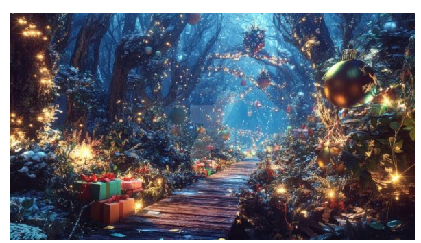
Happy in Christmas by Sanshow (Thailand)