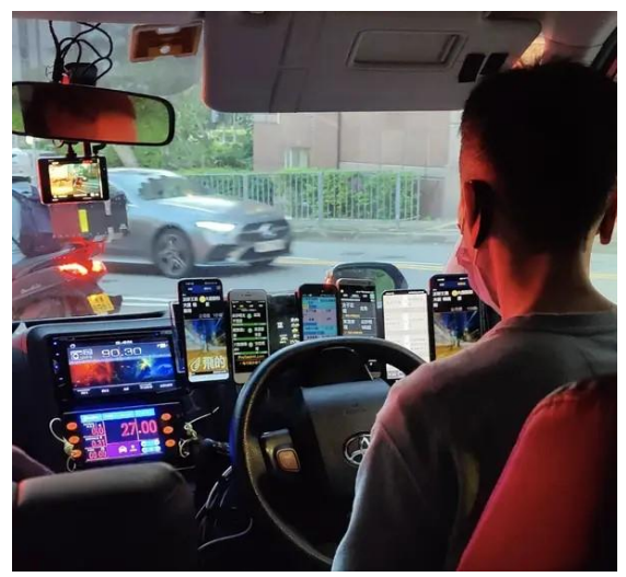
Want to ride in this cab where the driver seems to be paying attention to everything but traffic?