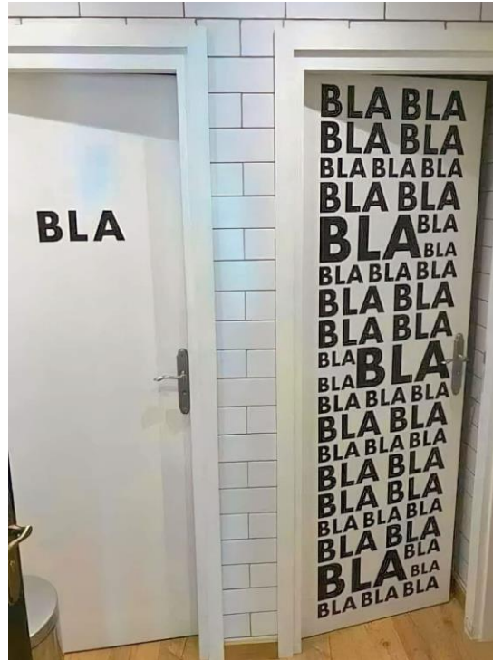
Men and Women's bathrooms