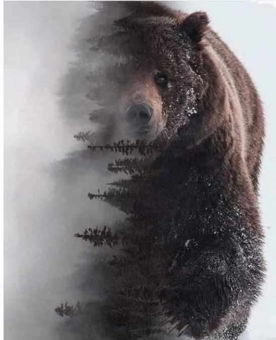
Untitled by ChrisB1274 (USA)