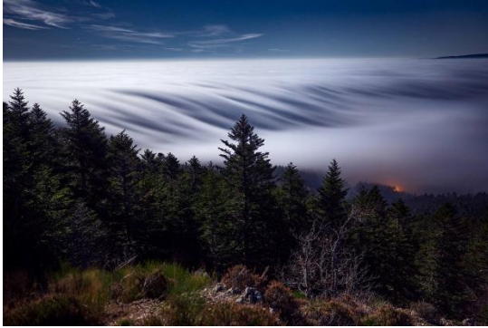
Tsunami by Florentcourty (France)