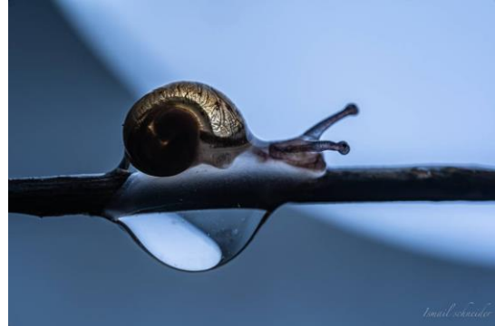
The Size of a Drop by Ismail Schneider (Portugal)