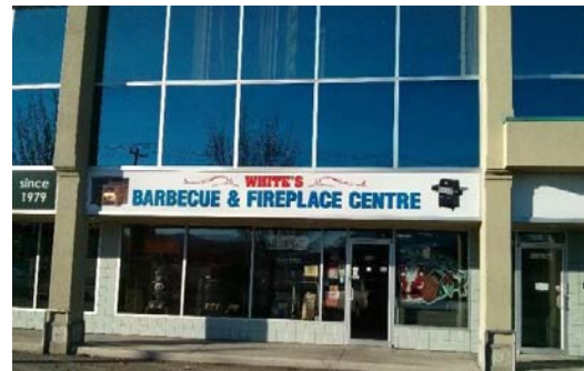
White's Barbecue and Fireplace Centre 160-2000 Spall Road, Kelowna, B.C. V1Y 9P6 250-862-3240 www.barbecueandfireplacecentre.com/