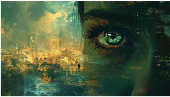
Past Life by AI Visions (Ukn)

When chickens communicate do they use foul language?