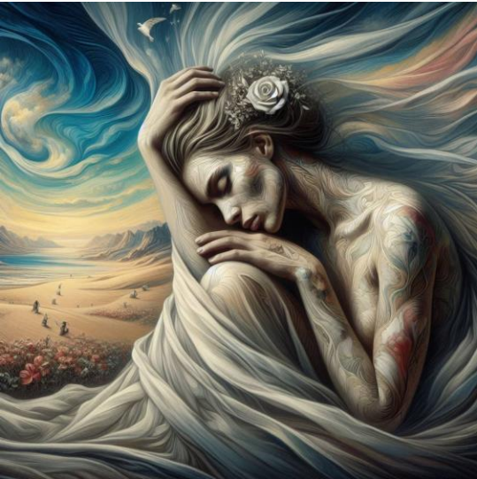
Where Silence Screams by Samit Digital Art (Samit Sinha - India)