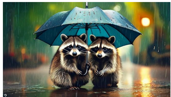
Umbrella by Bade3 (Saudi Arabia)