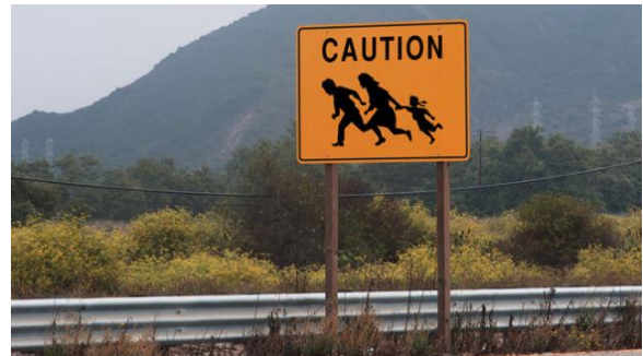
Illegal Immigrant Crossing Street Sign in California

This last sign saddened me when I found it. I understand the cold "why" the sign was posted but its necessity is saddening.