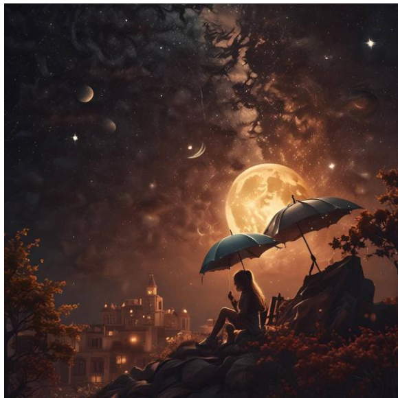
Umbrella by Horacio999 (India)