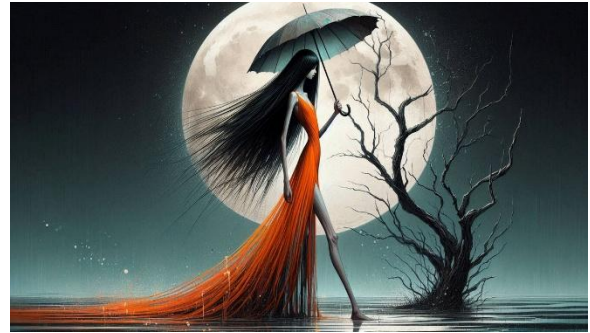
Woman in Orange by candystripe326 (USA)