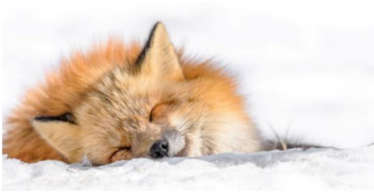
Screenshot_20230105_165718_407by Haileymaecappoen (USA)