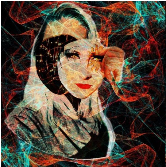
Making Autism 1