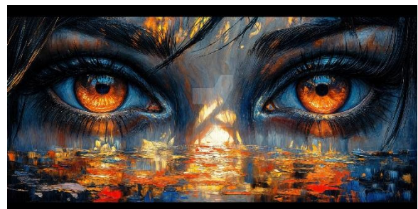
Your Own Soul by Asymoney (Slovakia)