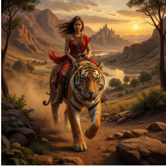
TA jan0190 by Norbert Warnke (Germany) - women deserve respect. Women who ride tigers are free to demand as much respect as they want.