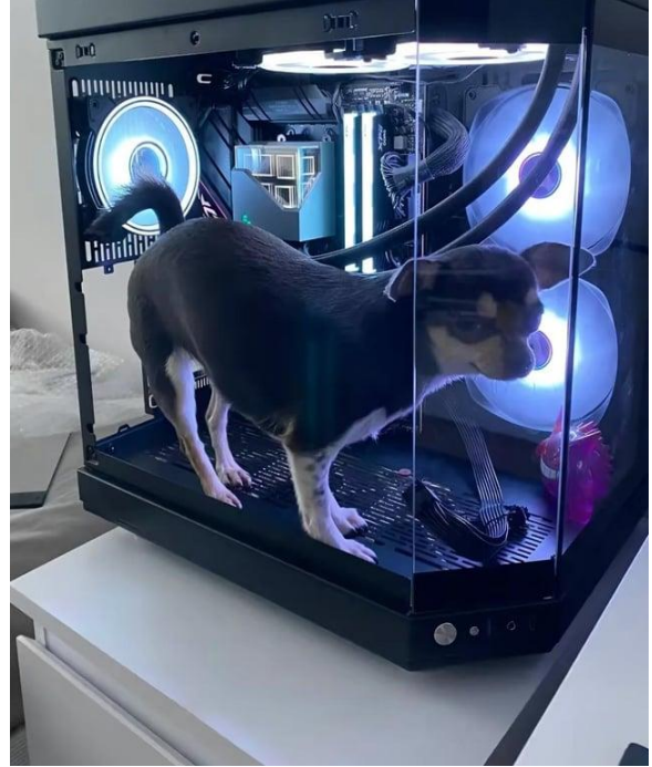
New PC for sale, ignore my dog