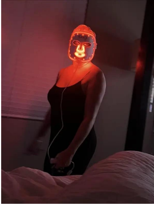
This wife and her skincare mask startled her husband