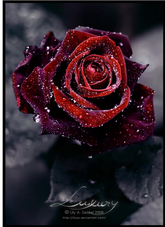
Luxury by Lily A. Seidel (Germany)