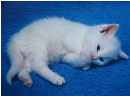
Thumbsucker by Lily A. Seidel (Germany)