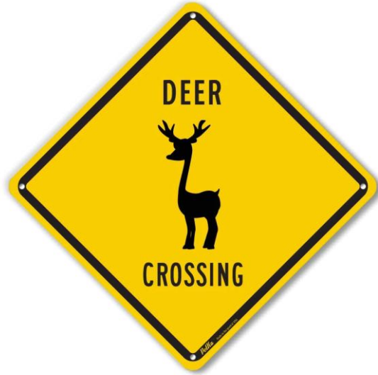
Anorexic deer crossing