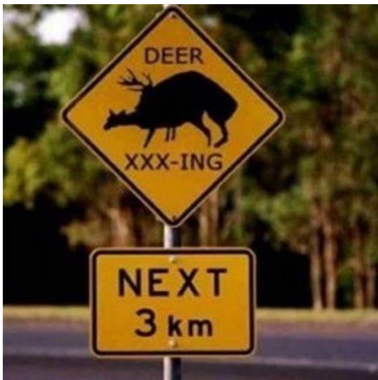
Very explicit deer crossing