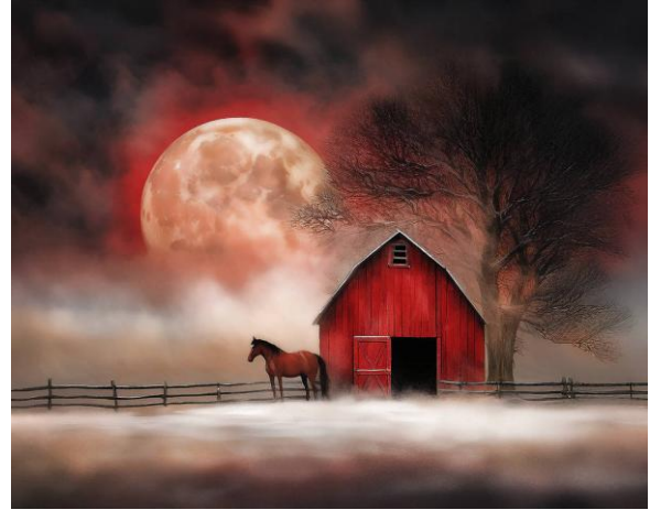
Painted Horse by Blue Horse Photo (USA)