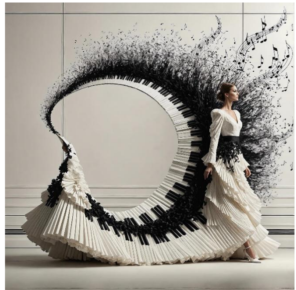
Concerto by Fragmented Dream (Canada)