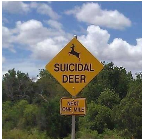
You have been warned