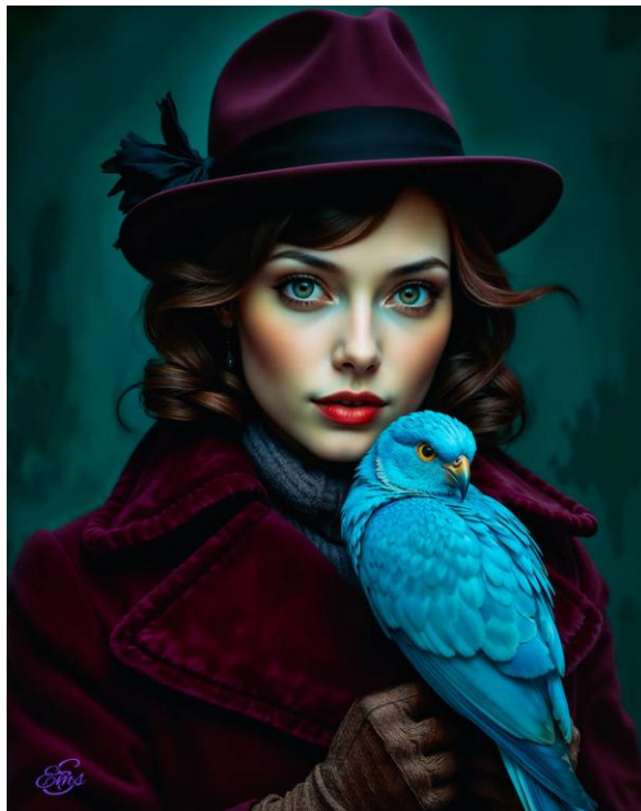
Rose and the Case of the Missing Bluebird by Tigerlady316 (USA) – striking use of colour