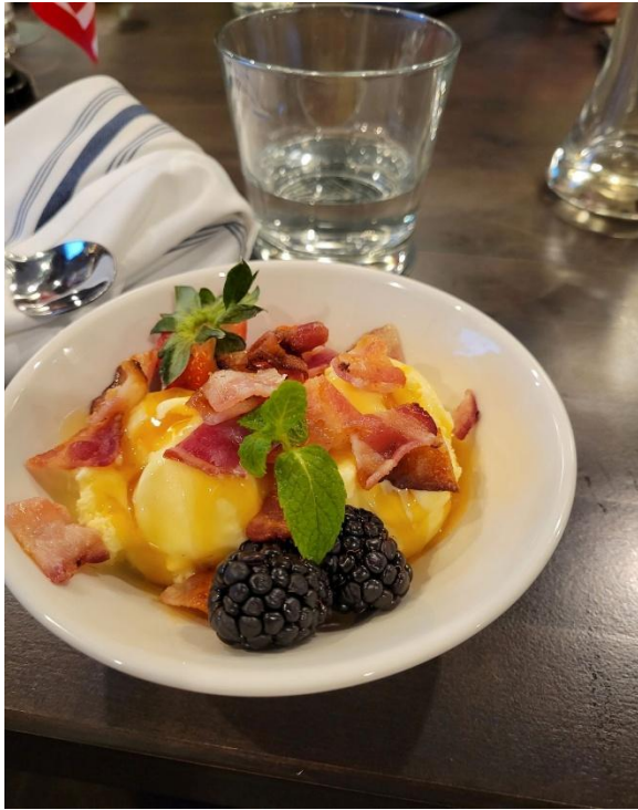
Ron's Special Dessert at Moxie's. Note the bacon on top of the ice cream, caramel sauce and berries. Yum yum!