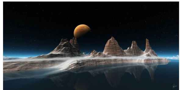
Moodyblue Stock 178 by Moodyblue (Brazil)