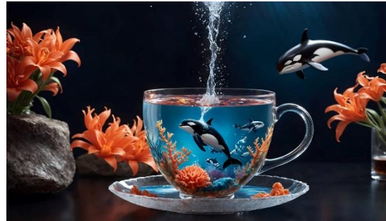
Cup of the Sea by AI 8K Art Generator (USA)