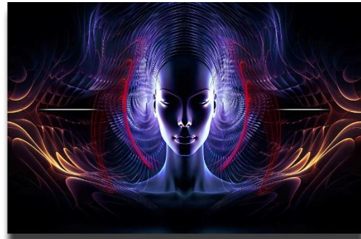
Dark Lady by William Sedlak (USA)