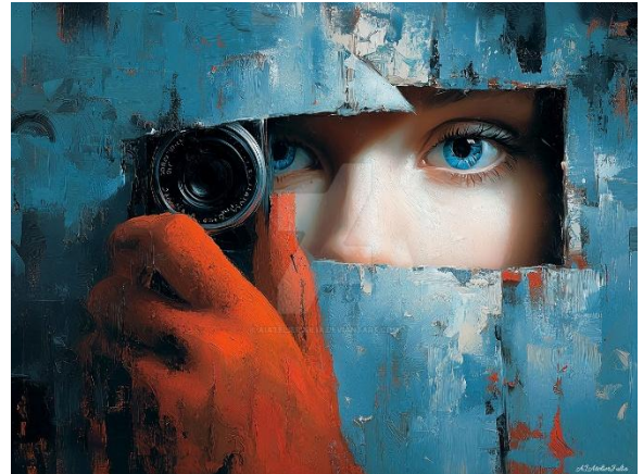
The Walls Can See by Julia Staeger (Switzerland)