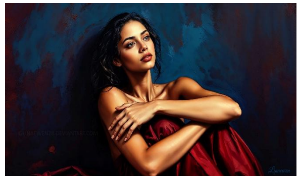
Within the Stillness by Linaewen28 (Ukn)