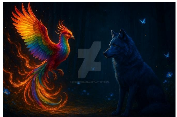
Mystic Beasts: Guardians of Wonder by Boundless Creativity (Ukn)