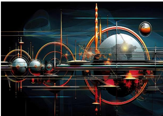
Cosmic Thoughts by Sed (Wm. Sedlak; USA)