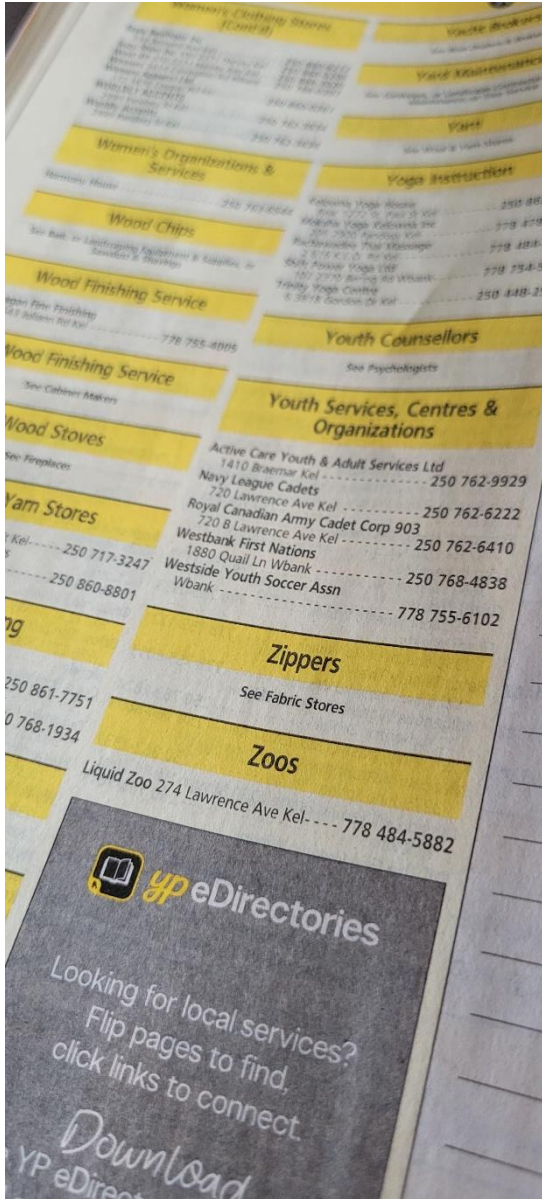
Check out zoos. For those who are not local, this zoo is a bar.