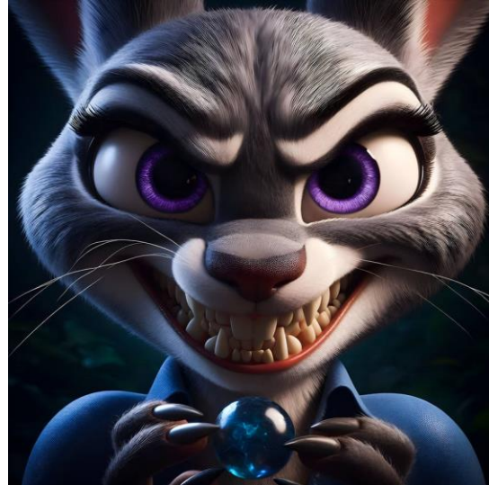
Going Savage by Sallys Ac Corn (New Zealand)