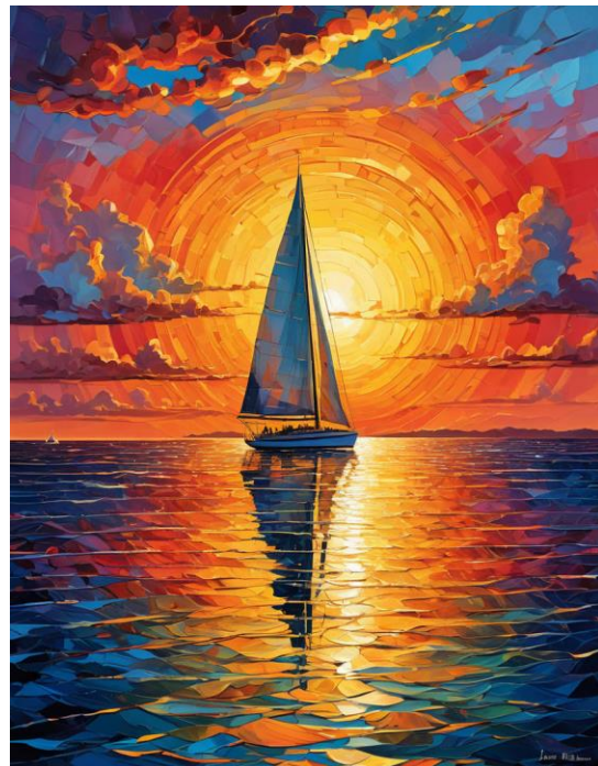
Color Play 24 by Jrp78624 (USA)