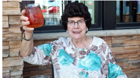
A big Hi! To everyone