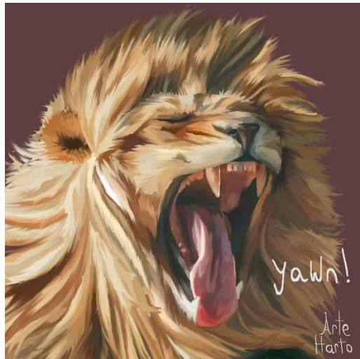
Sleepy by Cecelia (Argentina)