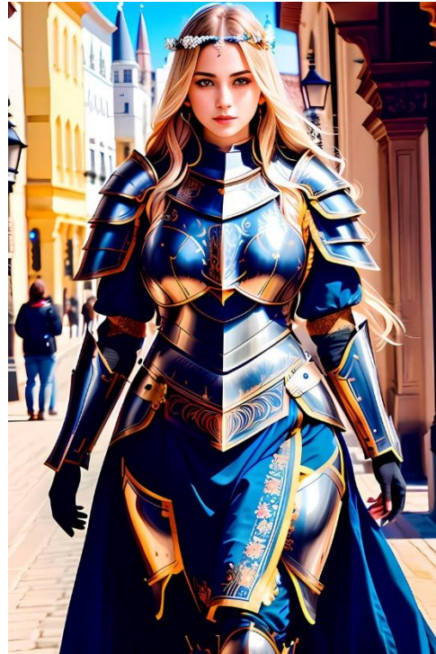
Paladin 5 by Neinzero (Ukn)

Paladin definition and meaning - A knight or a heroic champion. A strong supporter or defender of a cause.