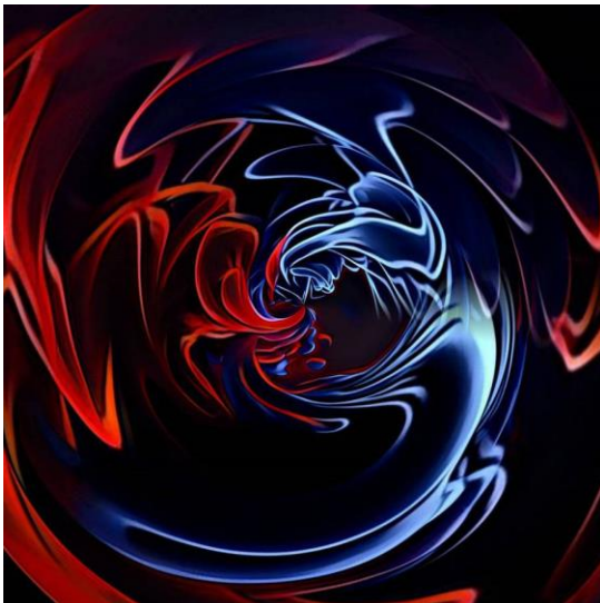
Two Cats by Frederick Shultz (Australia)