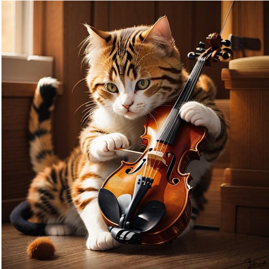
Cat Playing a Violin by Zena (USA) - got some extra front legs here.