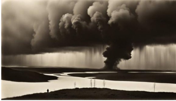
Apocalypse on a Lonely Road by Schopenhauer1788 (Ukn)