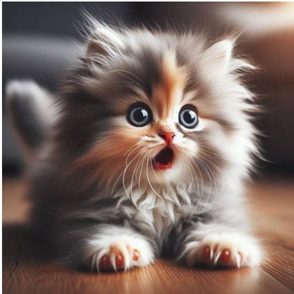
No Way by Noua Torok (Germany)