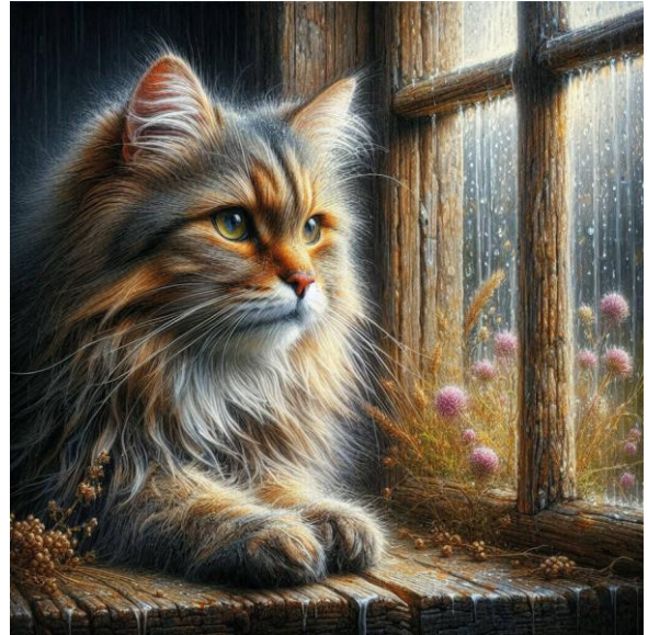
Ohhh Its Raining by Scratch14 (Venezuela)