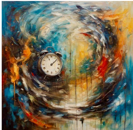
Waking From my Dream by Irishsean7 (USA)