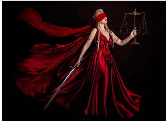
Themis by Fae Photography - Themis is the goddess of natural and divine law and justice