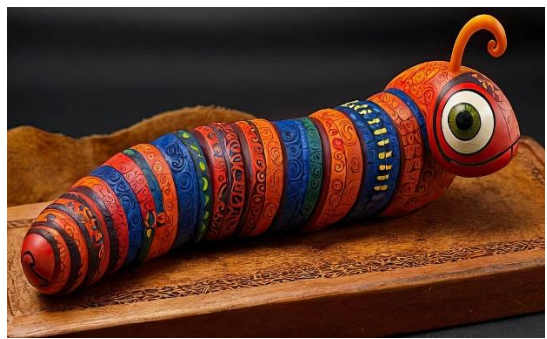
Gummieworm 2 by Surrealviewzeum (group of artists - USA)