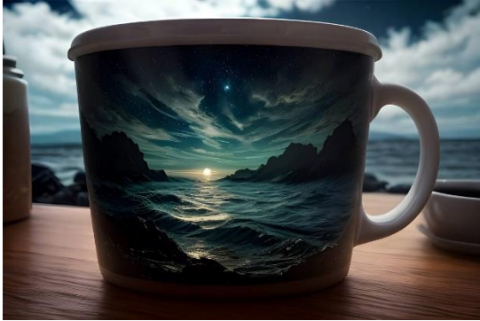
First Coffee by Imaljonur (artist group; unkn)