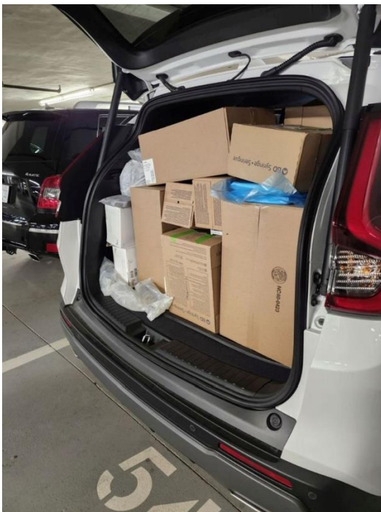
The trunk is stuffed in Kelowna

Christmas Party – Monday, Dec 16 th at Moxies.