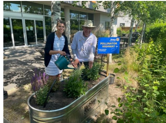
Karis pollinator garden

Pollinator Garden – We are looking at alternate sites such as a school that is being considered but the location is still being discussed. JoeAnna's House and the Legion have also expressed interest in a pollinator garden.