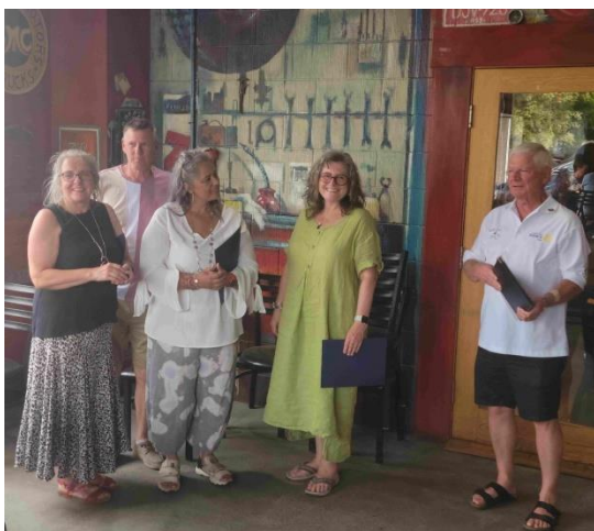
The new recipients of Paul Harris Fellowship.