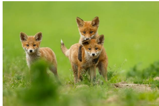
Mischiefs by Xbajnox (Slovakia)