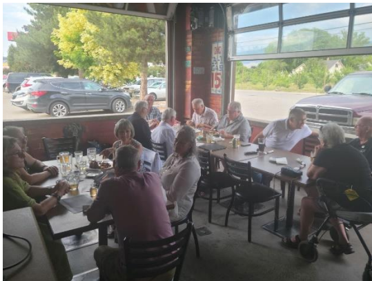
June 8 th Meeting