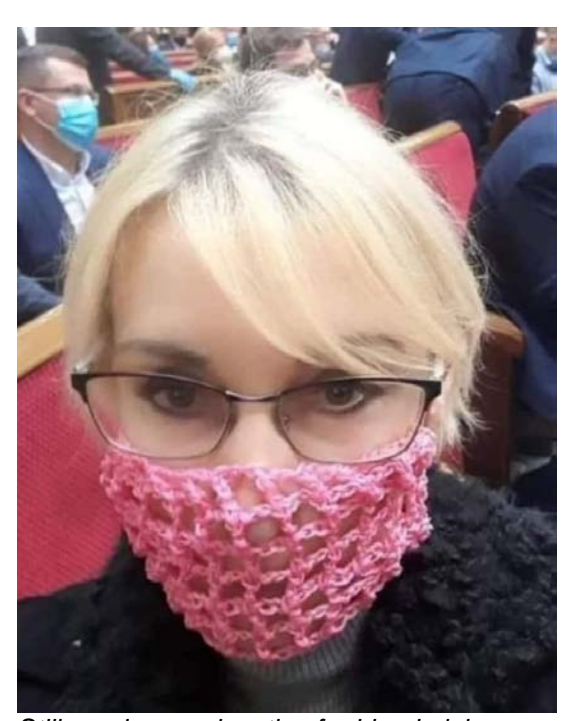
Still need an explanation for blonde jokes.