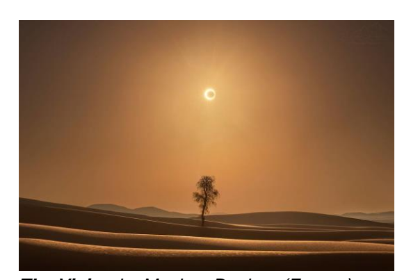
The Vision by Maxime Daviron (France)