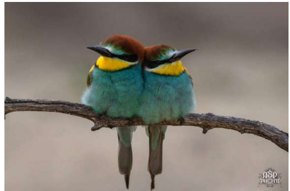
European Bee Eater (Merops apiaster) by Azph (Sweden) – They look well fed. Can it be our save the bees activities are doomed to failure?