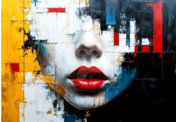
The Gaze of Justice by Nurrpu (Ukn)