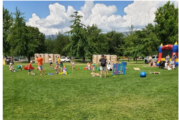
Play area for kids