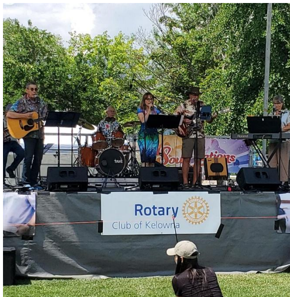
Band on stage

The Rotary Summer Kickoff Festival was held on Saturday, June 14 th from 11am - 6pm. In general, it ran very well with some short comings noted such as a lost-and-found for future events.