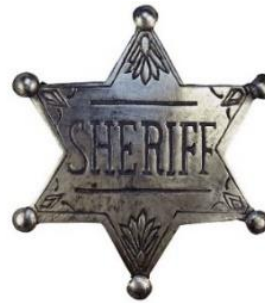
There was a Sheriff, and he took the usual fines to the usual response from members.