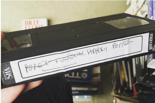
We all have our priorities