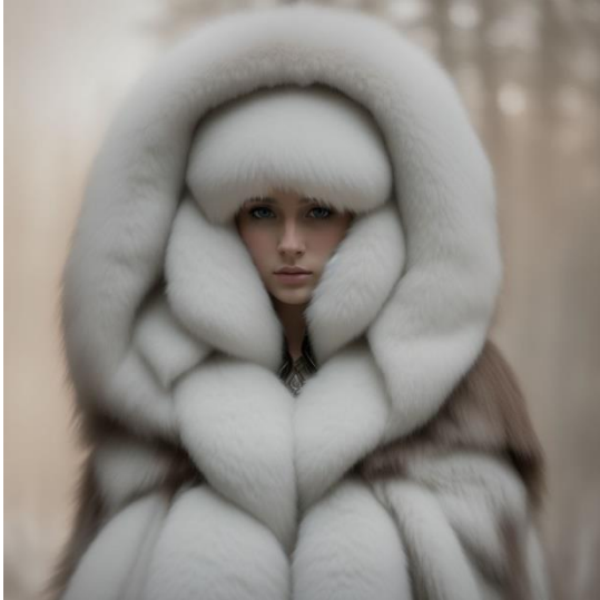
Freezing Cold by Lepelt (Belgium)