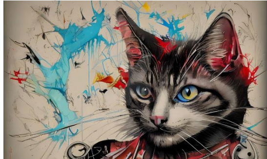
Painted One_4 by Knofels (Poland)