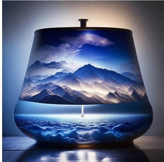
Scenic Lampshade by Express Images (USA)