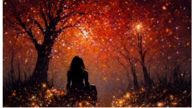
Lonely Nights by Dvdkrstf (Hungary)