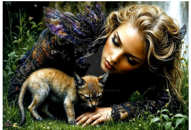
Gently by Kraken in Wonderland