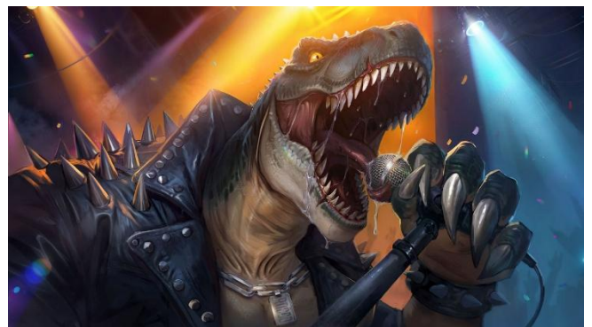
Thunderous Notes by Alaiorax (Poland)