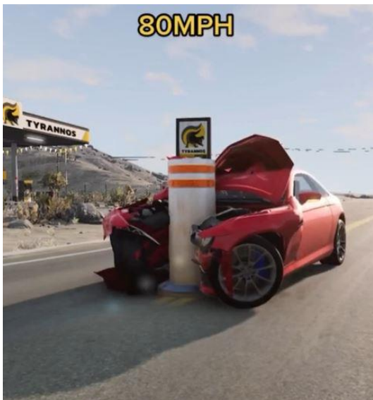
128 kmh – the Connector and Coquihalla posted speed