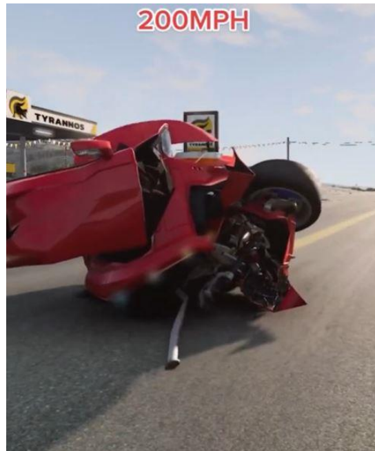
321 km/h – Moron in imported high-performance car. Survival is unlikely