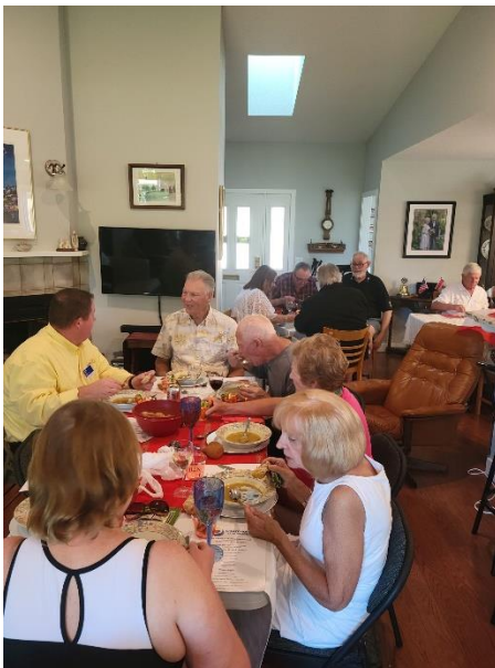
The assembled guests began the evening devouring a tasty French-Canadian dinner