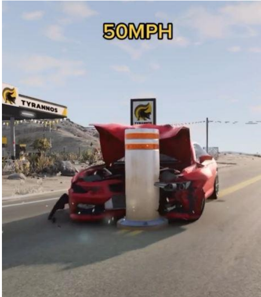
80 kmh – you see lots of this speed around Kelowna