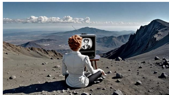
Modern Life by Stra 8 in jacket (USA)