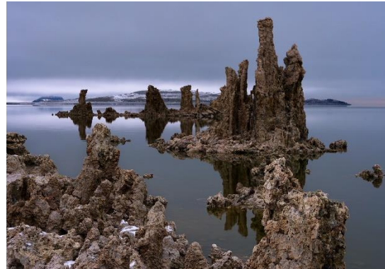
Bizarre Creatures by Philippe Lutz (Germany)

These strange sculptures are the product of spring water meeting the lake's alkaline water, causing the precipitation of solid calcium carbonate into tall spires. Once the lake's shoreline receded, these iconic tufa towers were revealed. The clouds on this day cast very strange light, which made the sculptures look even more extraordinary.