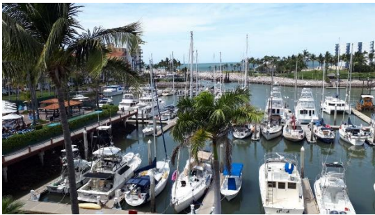
Local version of Kelowna Yacht Club!