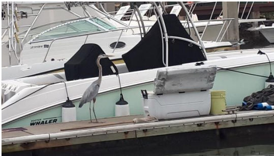
Ron makes a friend with the local version of Gardom Lake duck.