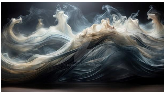
2024 136 by Angoma (Goran, Croatia)