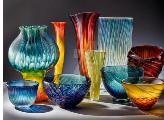
Beautifully Colored Glass Art of Bowls and Vases by Serene Artistry (Moroccan artists)