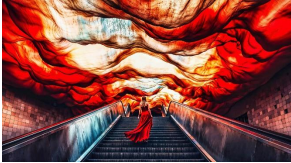
No Turning Back – Not Then – Not Now by Ashvillia (James Shelly - Greece)