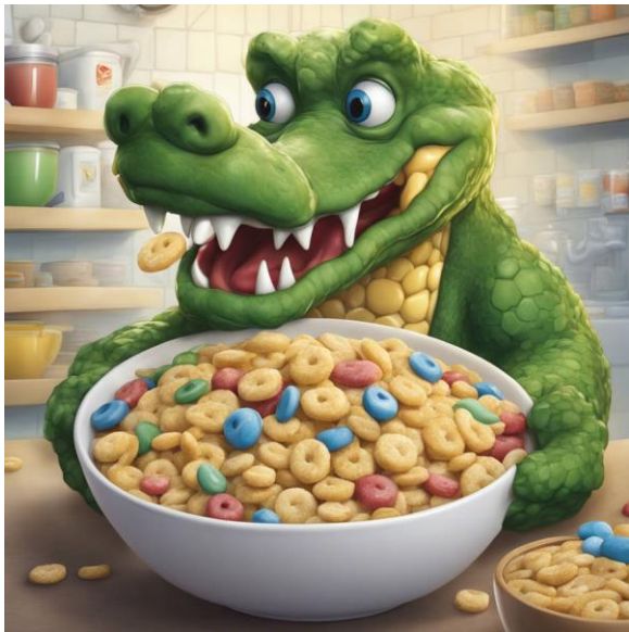
Cereal by steel Web Productions (Sweden)