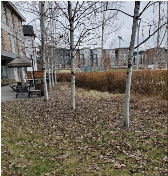
Karis garden area

Karis Pollinator's Garden – Winter refuses to go its own way and so we continue to wait.