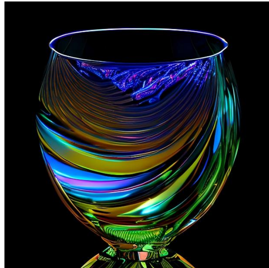
Glass Art 23 by 77tradewinds (USA)