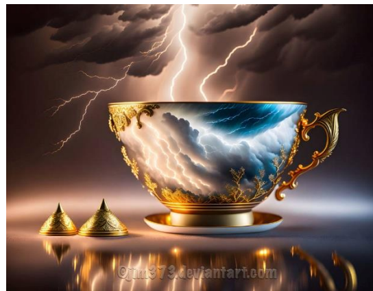
Another Cup of Tea Dear by Jim373 (USA) – digital AI art