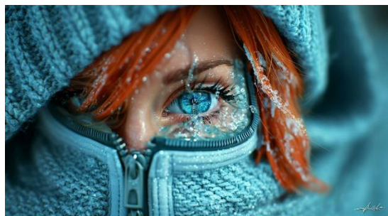
Freezing and Wet Spring; You're Your Zipper Up

The latest meeting was a business meeting and so no speaker was scheduled.