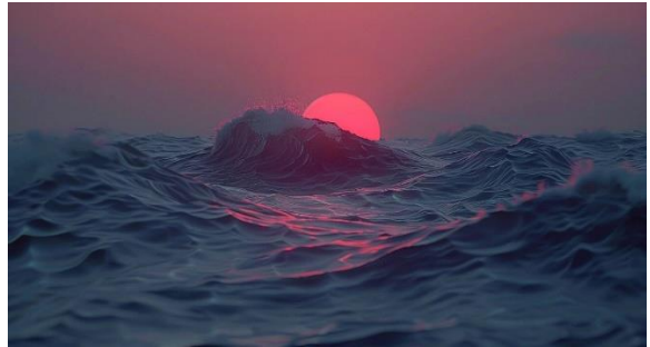
Vaporwaves by Fahcup (USA) – likely AI