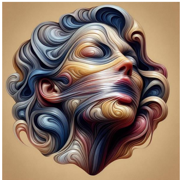
Swirl by Plastic247 (ukn; Italy)