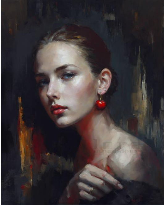
Girl with a Cherry Earring by Lora Vysotskaya (Ukraine)