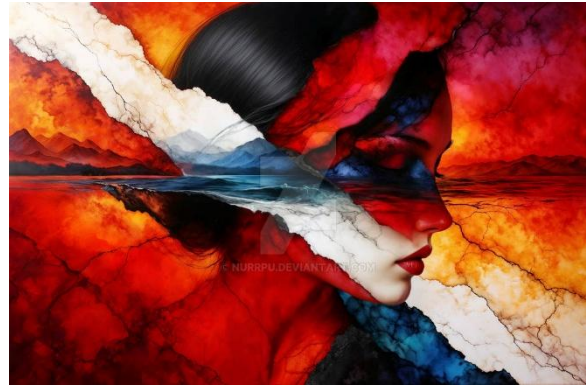
Fragments of Memory by Nurpu pm (Ukn)