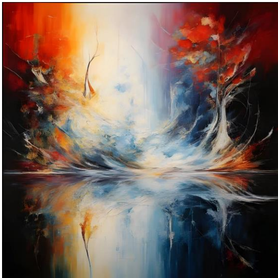
Ephemeral Symphony Reflection of Timelessness by Nikulusev (Russia)