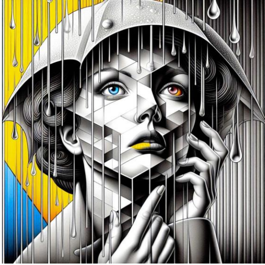
Inpixio by Ynot011 (New Zealand)