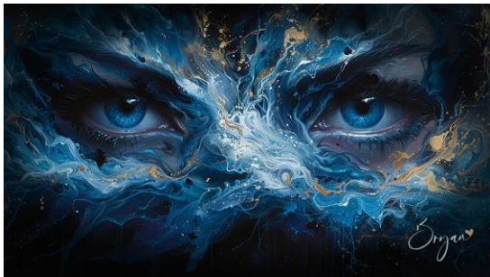
Materialize by The Lovetrain (art group, USA)

No speaker was scheduled and so none came.