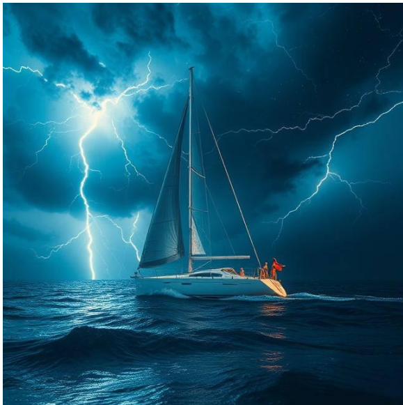
Unknown 5 by Johnoisethagenbjork