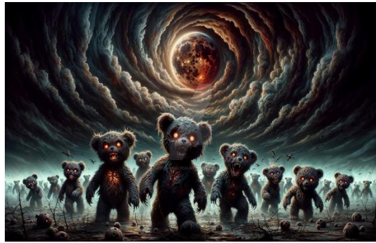
Rise by Nocturnal Realms (Ukn, Spain)