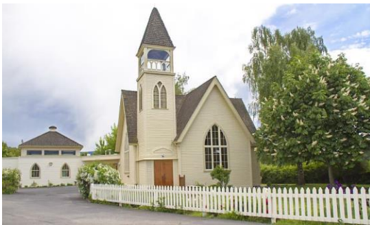
Benvoulin Heritage Church

Their mission is to " build awareness of the district heritage of the Central Okanagan through conservation, collaboration, advocacy and education for the benefit of current and future generations. "