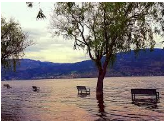
Kelowna beaches for most of the 2017 summer

Theresa Fillion, as a commercial insurer, chose the topic of the cost of extreme weather related damage this evening. Her questions included "In 2017, how much insured damage occurred? ($590,000.000); of this which cost more, flooding damage or fire damage across Canada? ( flooding ), and how many Canadians are at risk of flood damage? ( 20% of the population ). To put our minds at ease she then told us that the local snowpack was at 135% of normal at this moment but they were drawing down the lake.