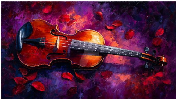
Nocturne in Violet by Visionary Loops AI (Ukn)