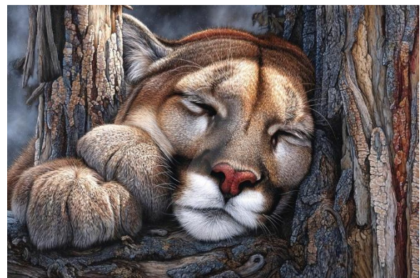
Shelter of Dreams by Vitoria A 4art (Brazil)