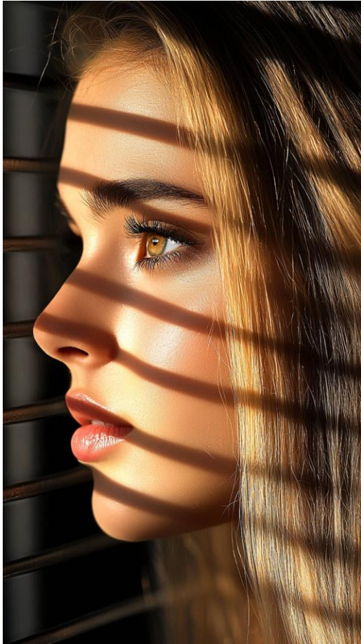
Blades of Light by Chagnar Faughn (USA) - use of artistic talent, artificial intelligence (AI) and Photoshop.