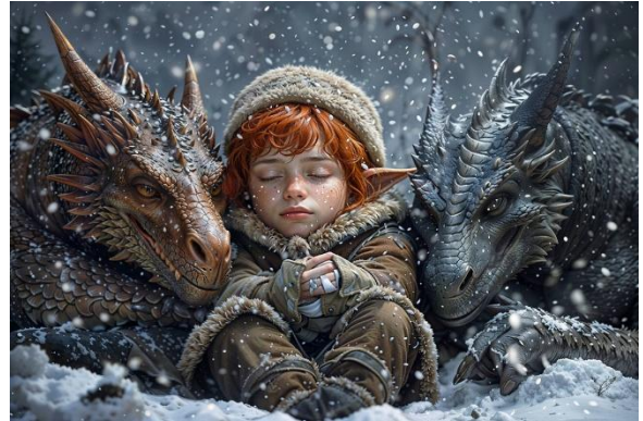
Fear Not and Sleep Well by Adored Hades (USA) - I'd like two dragons telling me to sleep well in my afternoon nap and that they'd take care of anyone ringing the doorbell and offering to clean the windows or paint my house.