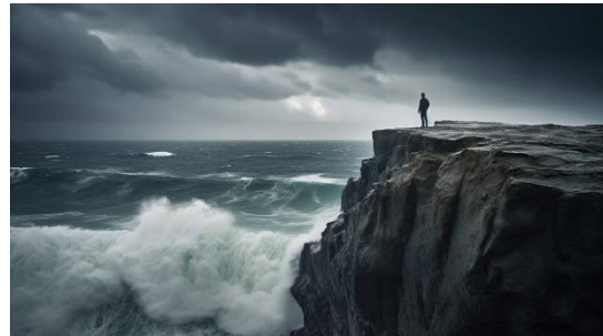
Waves by lamrudja - Rudja (Ukraine)