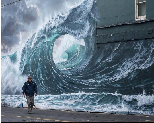
Morning Walk by the Fulkrum (ukn)

I liked the concept of this picture with the man enjoying a calming stroll while everything is coming apart around him. I also was required to accept that it was some sort of science fiction painting with unnatural rotational forces at play to create those waves.