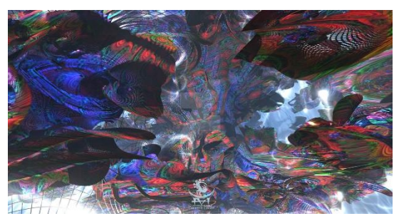
Waterworld by Vulpecula Art (Germany)