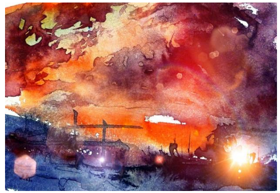
Red Sunset by Mikko Tyllinen (Finland)