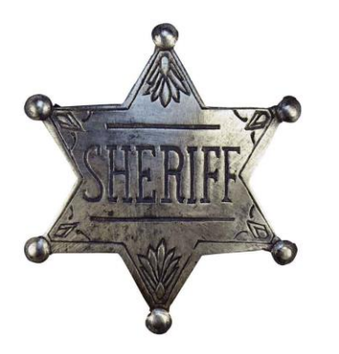
Sheriff – There was no Sheriff this week due to it being a small meeting.