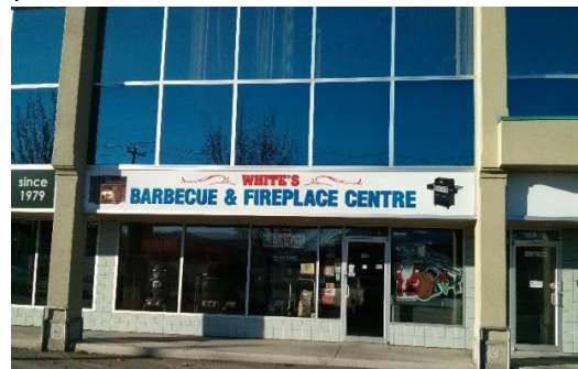
White's Barbecue and Fireplace Centre 160-2000 Spall Road, Kelowna, B.C. V1Y 9P6 250-862-3240 www.barbecueandfireplacecentre.com/