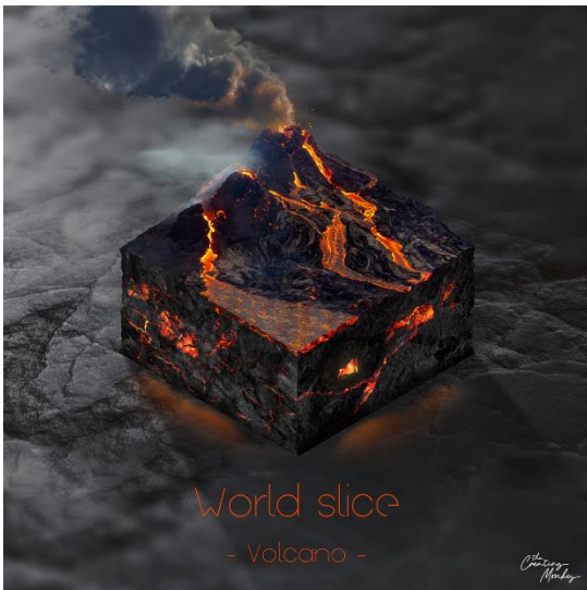
Volcano by Noxillunis971 (Italy)