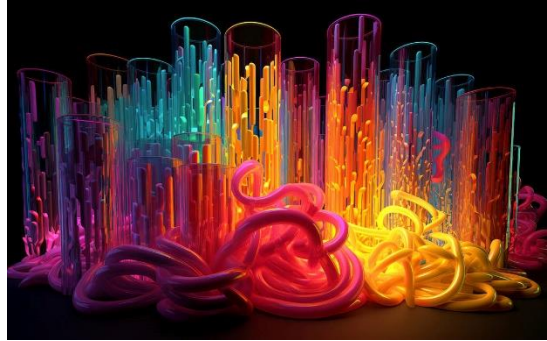
Matter of Dreams by Kkuzy62 (USA)