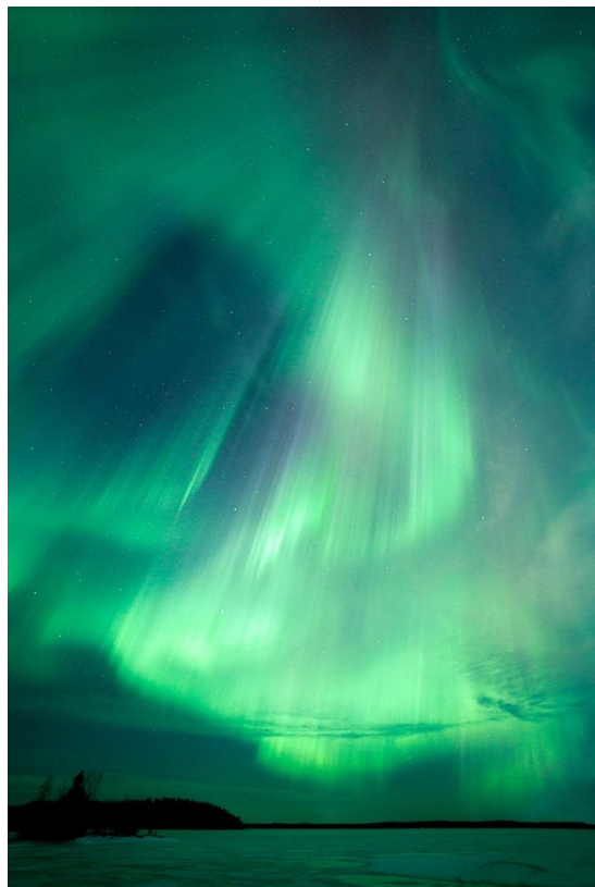
Northern Lights Night Sky by Juhani Viitanen (Finland)