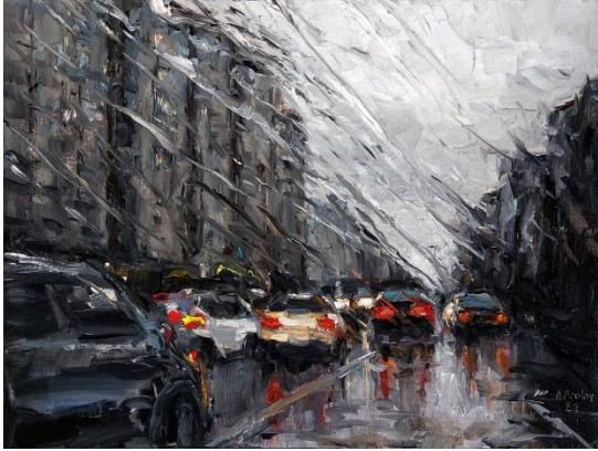
The Broken Wipers by Kznsq (Ukraine)