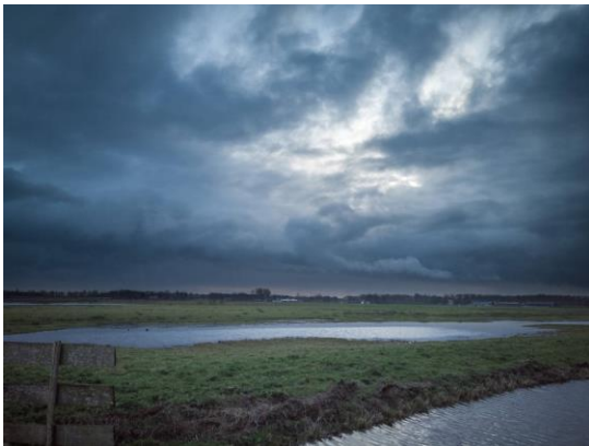
Dutch Winter Landscape by Ditishet (Netherlands)