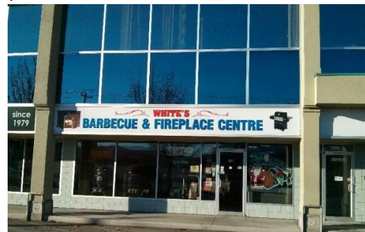
White's Barbecue and Fireplace Centre 160-2000 Spall Road, Kelowna, B.C. V1Y 9P6 250-862-3240 www.barbecueandfireplacecentre.com/