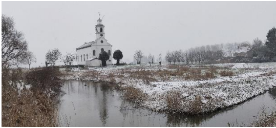
First Snow in Two Years - Jan 16, 2021 by Ditishet (Netherlands)