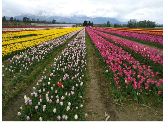
Tulip farm in Chilliwack – these tulip flowers are not for the market but are grown for the bulbs