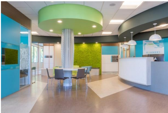
Walk in area

One interesting change was to create a facility that has been decorated in a welcoming fashion rather than the typical hospital waiting areas.