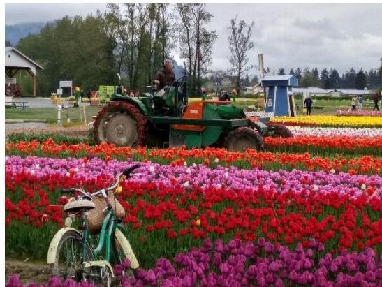
This tractor is a "tulip eating machine". The tulip heads are cut to build up the tulip bulbs Photos and explanation by Leo