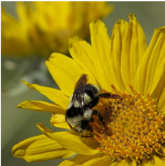
Bee hard at work pollinating Photos and explanation by Ken (a friend of mine)