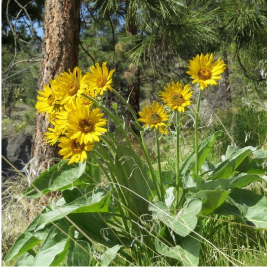
Arrowleaf balsamroot aka Okanagan Sunflower already showing effects of too much sun