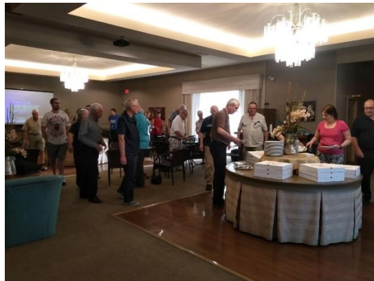
Pizza is served!