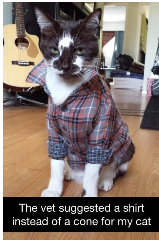
The vet suggested a shirt instead of a cone for my cat