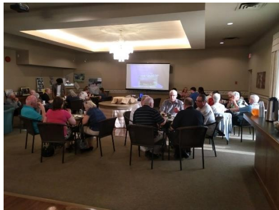
Rotarians and Rotaracters do what they do best