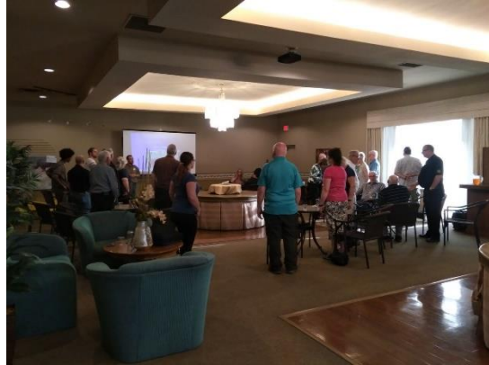
The two clubs gather

Big thanks to Kettle Valley's Papito's Pizza for the special pricing on the pizza's!