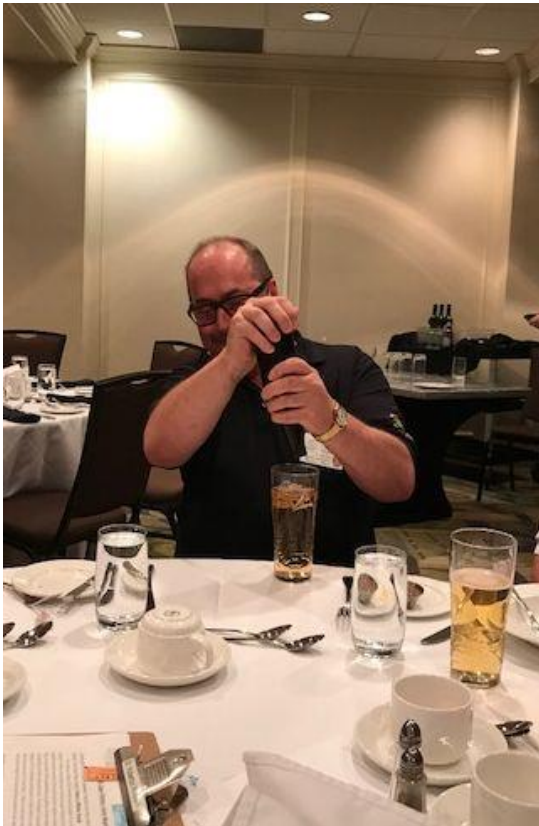
Getting the last drop beer out!