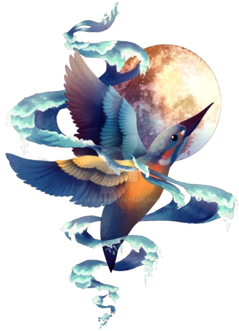
Luna by Leaquoia (Germany)