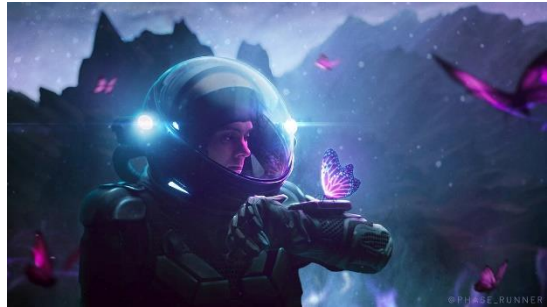
Neon Butterfly by Phaserunner (UK)