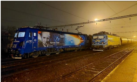
Night Trains by Sandor79 (Hungary)