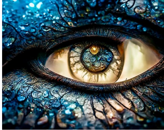
The Golden Dream in Your Eye by Monika (Germany)