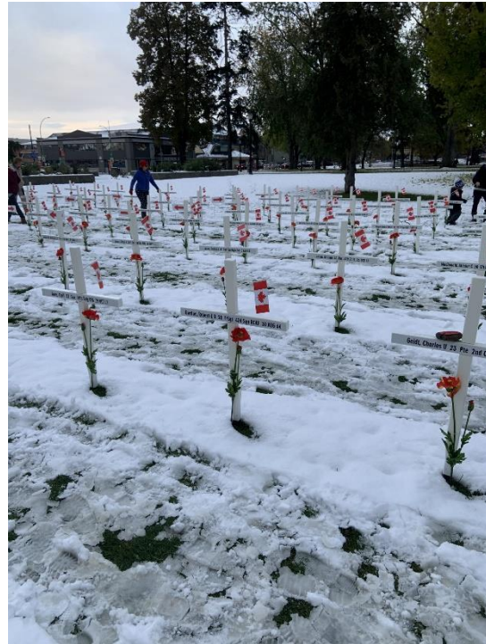
Field of crosses honouring the fallen

Remembrance Day – There was no formal ceremony in Kelowna this year but some efforts were made.