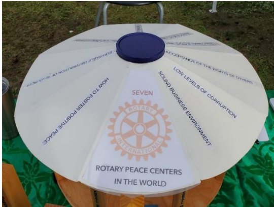
Rotary Peace Centres Carousel

Remembrance Day – There was no formal ceremony in Kelowna this year but some efforts were made.