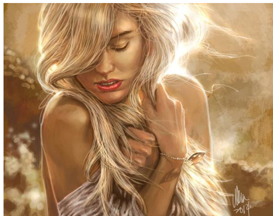
Pretty Girl in Front of the Light