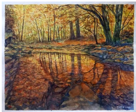
The Creek in Autumn