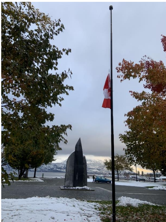
Flag and Cenotaph