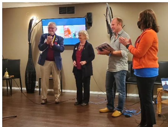
Our newest club members being welcomed by all those in attendance