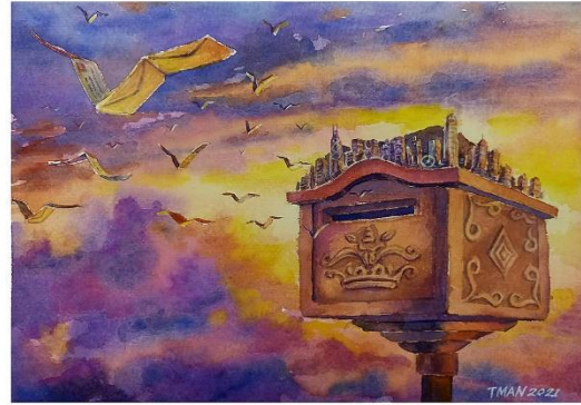
Letters to Hong Kong