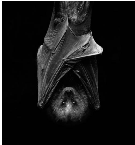
Fruit Bat by Hidarine Images (UK)