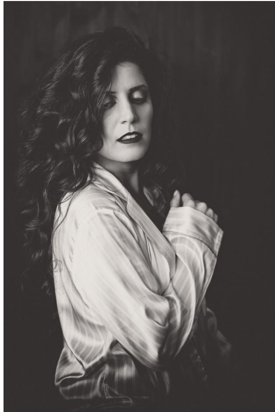
Nirit 91 by Flyy1 (Israel)