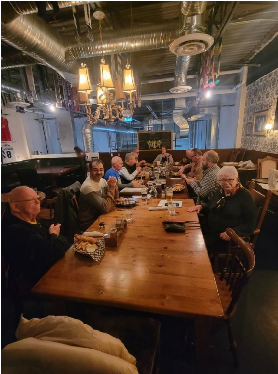
Our meeting at the Welton Arms last week

We meet at the Welton Arms Craft Beer and Restaurant . 890 Clement Ave #304, Kelowna, BC