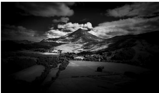
Scotland 5/n by Emden09 (Germany)

This week I got interested in black-and- white photography. B&W images are easy to obtain simply by removing the colour in our digital images during post-processing, but it is the composition of the picture that still challenges the photographer.